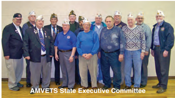
AMVETS State Executive Committee